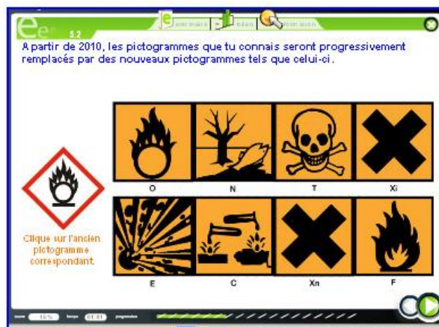
(Fig.2. Pictograms and chemical products)

Prevention in the chemistry laboratory is essential to a secure experimental practice. Students must be made aware of safety instructions before the first lab work. One topic of the prevention is reflexive reading of the chemical products labels in the laboratory. On the labels are danger signs, the most visual elements on the label. Thanks to this resource the danger signs of chemical products regularly used in the laboratory can be discovered in an interactive way. Since currently used pictograms are being replaced by new ones (applied since 2010), this application is useful to make the transition easier.