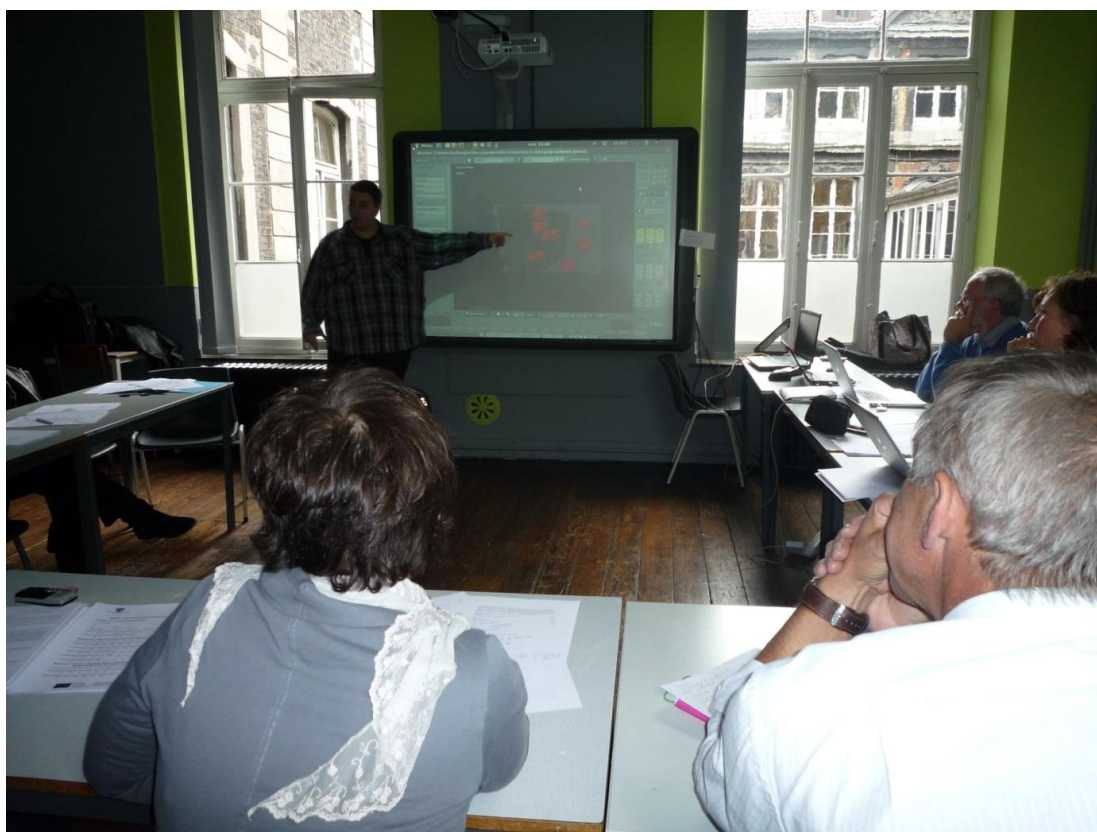
(Fig. 3. Workshop)